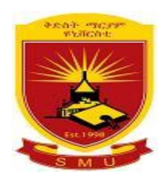
St. MARY'S UNIVERSITY SCHOOL OF GRADUATE STUDIES MBA IN ACCOUNTING & FINANCE

THE PRACTICE AND CHALLENGES OF TAX ASSESSMENT OF CATAGORIES "A" TAXPAYERS. A CASE OF AKAKI KALITY SUB CITY ADDIS ABABA CITY ADMINISTRATION