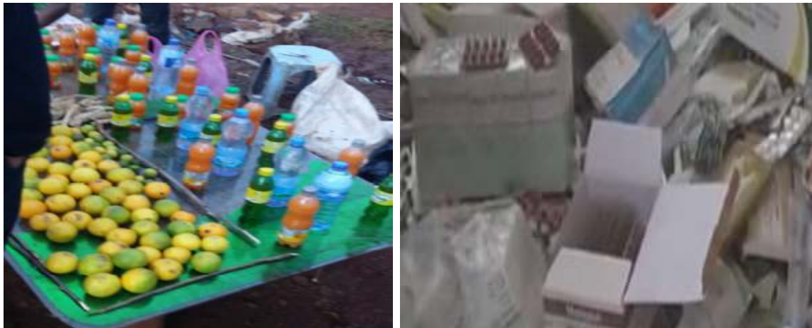
Fig: street market at “Bulehorra” where contraband drugs and beverages are sold