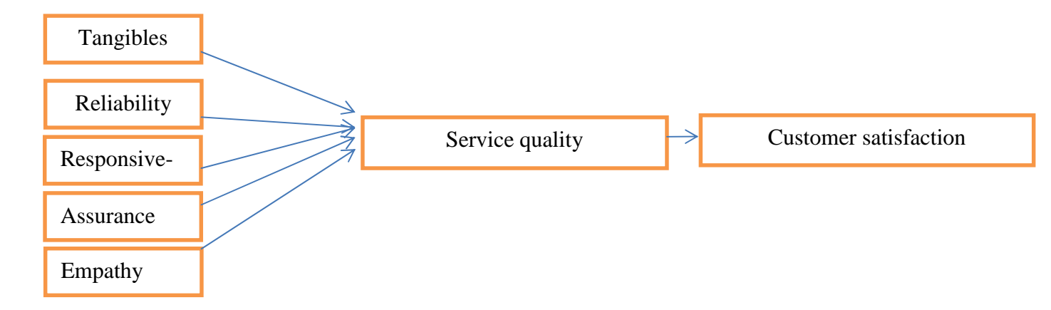
Fig.2.2 Relationship between the dimension of SERVQUAL and customers satisfaction. Source:Parasuraman modified for the study

The conceptual framework presented below it is adopted from the Parasuraman et.al. (1985) gap model theory.