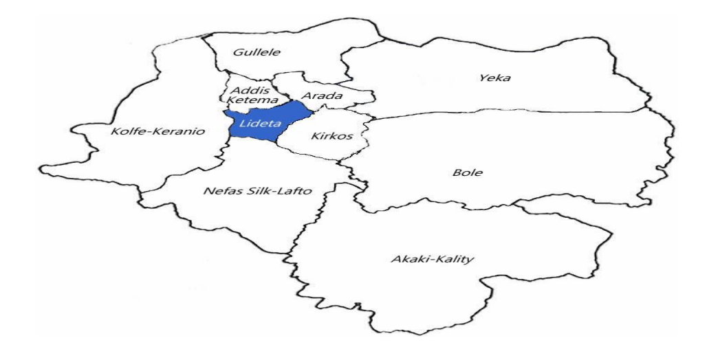
Scale: - 1:6750000