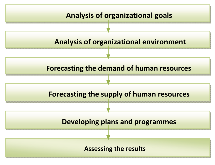
Figure 2.1. The Strategic HR Planning Process