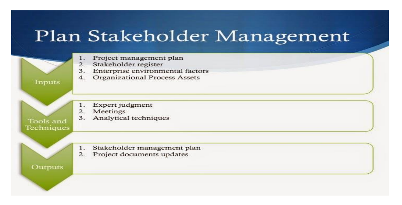
Figure: 2.1. Stakeholder Management Inputs, Tools and Techniques and Out puts

As with other planning processes, there are "generic" tools and techniques that are used in practically all knowledge areas, such as expert judgment, decision making, and meetings. You talk to the people who know about your knowledge area, you get together with your project team in meetings, and you make decisions about what goes in the management plan (PMI, 2018).