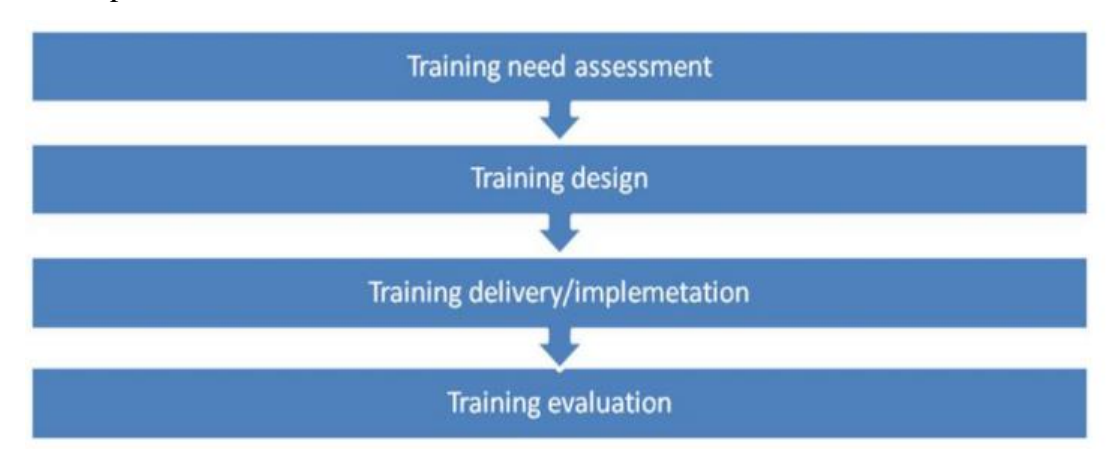
Figure 1. Model of Training Process

The implementation of training and development serves as transformation process. Untrained employees are transformed into capable workers and present workers may be developed to assume new responsibilities. To verify the program's success, personnel managers increasingly demand that training and development activities be evaluated systematically. Lack of evaluation may be the most series problem in most training and development efforts.