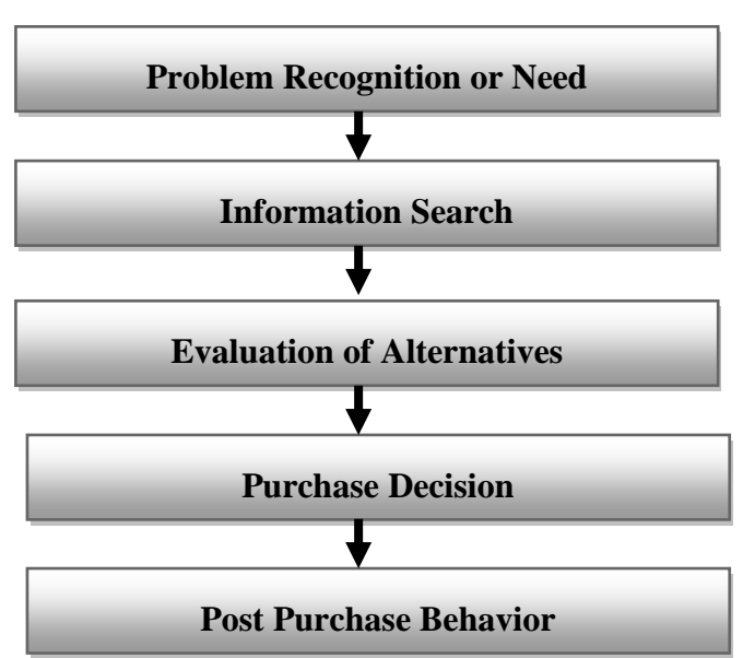
Figure 2.1: 'The five stage model in consumer behavior'

Marketing scholars have developed a "stage model" of the buying decision process (see Figure 2.1).