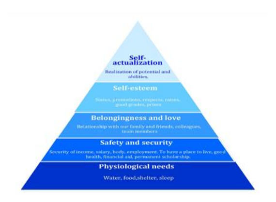
Figure 1Figure 2.1: Maslow's hierarchy of needs

He suggested that people start on the bottom and put efforts to go up to needs hierarchy. When one need is fulfilled, it loses its strength and the next level of needs is activated. A satisfied need is longer a motivator