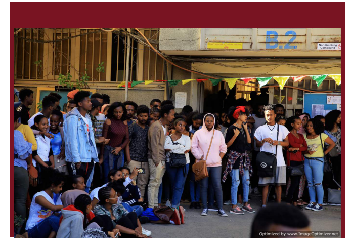
MBA Students' Participated in a Week-long Educational Events in Italy

guage Training Center in Addis Ababa shared his personal and professional experiences together with his body flexibility talent. H2 Computer and Language Training Center awarded scholarships for 2 SMU students to take any foreign language training of their choice.