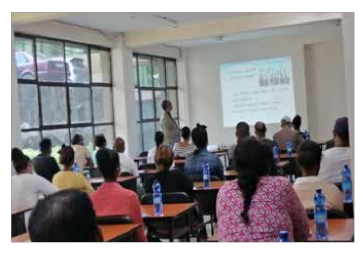
ቅድስት ጣርያም ዩኒቨርስቲ የትምህርት መሣሪያዎች ድ ጋ ፍ አደረገ

ለማማሽ ቀን በተካሄደው በዚህ ውይይት የአገልግሎት አሰጣጥ ጽንሰ ሃሳብ በተግባር ከሚታዩ ሁኔታዎች ጋር እየተገናዘበ ውይይት የተካሄደበት በመሆኑ ተግባር ተኮር ውይይቶች በእጅጉ አስፈላጊና ጠቃሚ መሆናቸውን በውይይት ሰዓት ከተነሡት ሃሳቦች ለመረዳት ተችሏል::