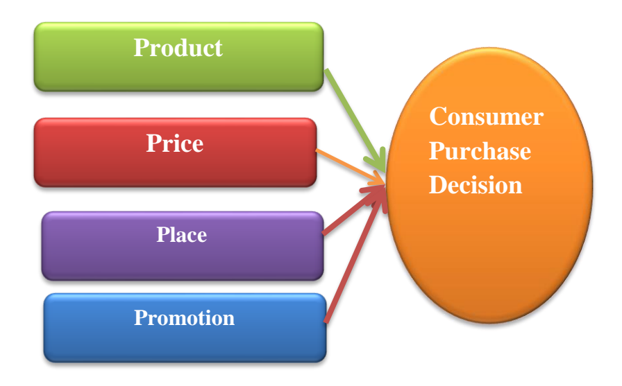
Figure 2.3: Conceptual Model

Source: conceptual framework adopted from Singh (2012) and Aaker (2003)