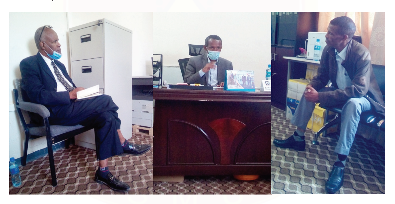
A team of CEIQA sharing AASTU's Internal Quality Assurance Experience

Follow University World News on Facebook