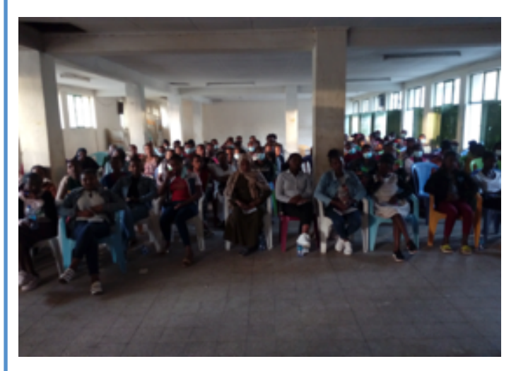
SMU celebrates Ethiopian Christmas with elderly

Major topics covered during the training were: assertiveness, self-awareness, self-esteem, goal setting and prioritization, time management, and stress management.