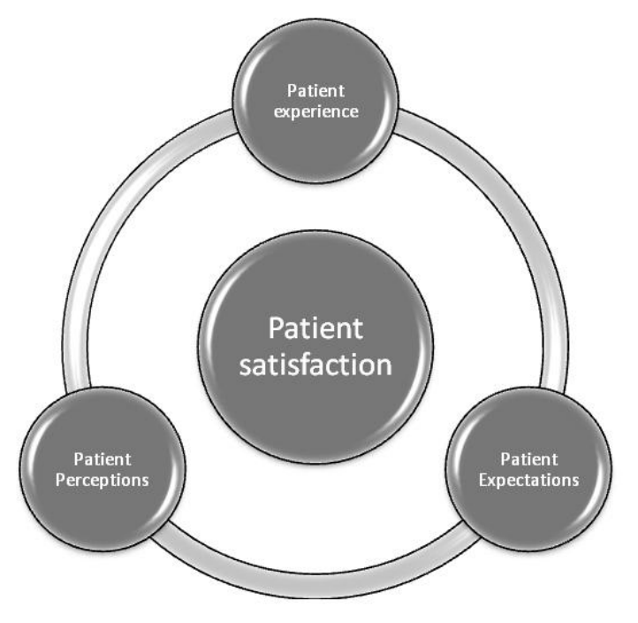
Figure 1: Determinants of patient satisfaction with health care system

Self perceived health status and personality of the person utilizing health care services are important determinants of patient perceptions. Interventions that shows considerable improvement in patients' perceived quality of care and attached satisfaction is contracting out of services at public health facility leading to more availability of doctor, paramedic and medicines, reduce waiting time by increasing health personnels and decreasing staff absenteeism (Naseer, Zahidie & Shaikh, 2012).