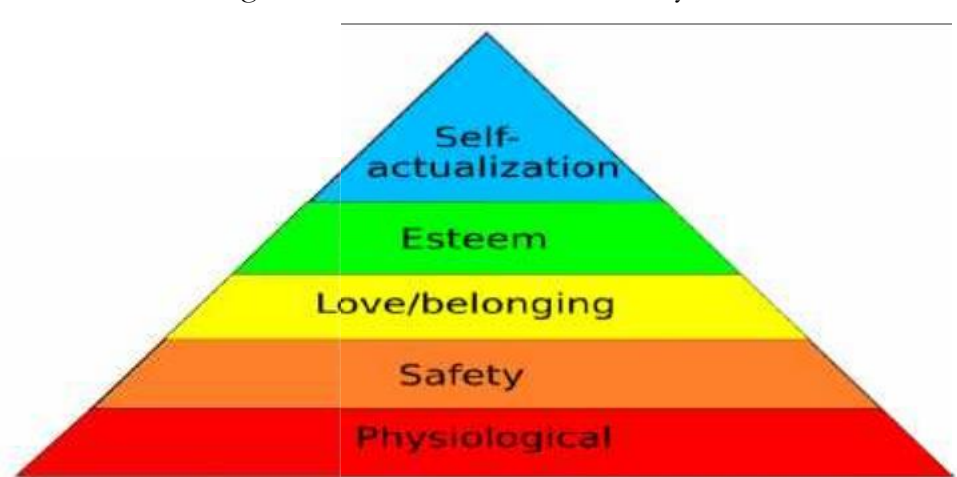
Figure 1: Maslow's Need Hierarchy

It is the drive to become what one is capable of becoming; it includes growth, achieving one's potential and self- fulfillment. It is to maximize one's potential and to accomplish something. Self-actualized people tend to have motivators such as truth, justice, wisdom and meaning. (Mullins 2005).