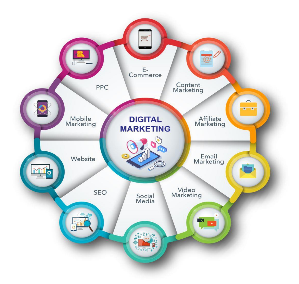
Figure 1: Types of Digital Marketing