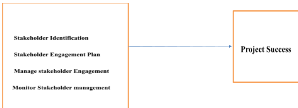
Figure 1. Conceptual framework

A conceptual framework has been provided as follows, based on the aforementioned ideas and studies that have been carried out, including the Project Management Institute PMBOK Guide, sixth edition, 2017: The primary focus of the study was the PMI-based project stakeholder management methodology (2017).